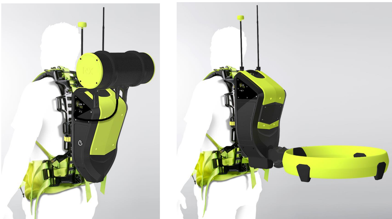
Figure 1: Illustrations of the final design of the Loupe TEM system showing 3 component receiver system (left) and transmitter system (right).

Real time control of Loupe functionality and QC of data is carried out via a small wireless tablet PC carried by the operators. Software on the tablet will be capable of navigating the operator along a pre-defined grid and plotting TEM decays and profiles for review.