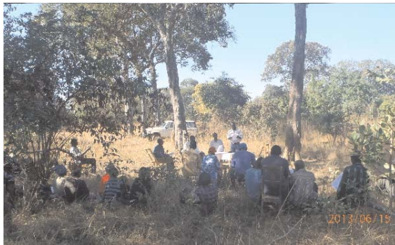
Communities engagement at an Exploration project

On a day-to-day basis our Exploration group contributes to local communities by employing local people and introducing improvements in local health and safety practices.