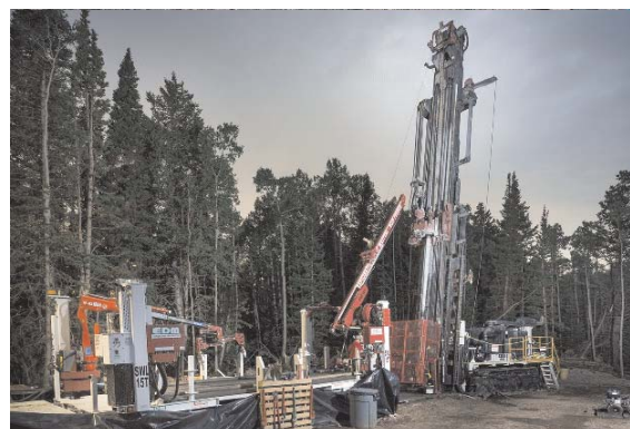
Drill Rig at Hidden Treasure project

We set ourselves apart from the rest of the mining industry by having a clear focus on finding and mining only the best resources. These resources must be profitable in all parts of the price cycle and deliver long-term economic value to Rio Tinto, the communities we work with and the countries we operate in.