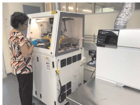
Laser Ablation Microprobe (LAM): Trace Element Mineral Chemistry