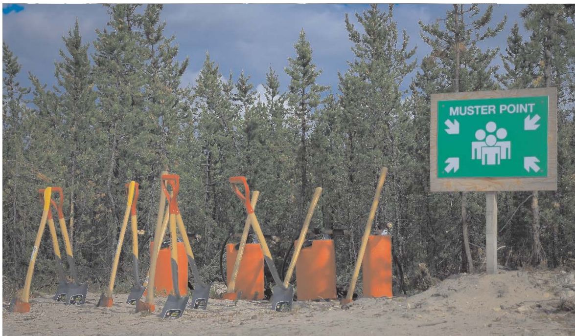
Demonstration of muster point at Exploration project

There is no room in Rio Tinto Exploration for anything but the most value-creating opportunities, the most constructive, collaborative and adaptable behaviours; and a personal commitment to sustainable development from