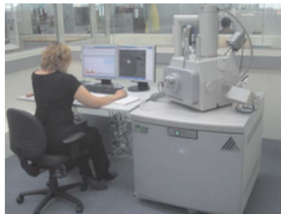
Mineral Liberation Analyser: Quantitative mineralogy and major element chemistry

These datasets are interpreted by a dedicated team who combine mineralogy expertise with data analytics and research outcomes from industry collaborative projects to support exploration programs globally.