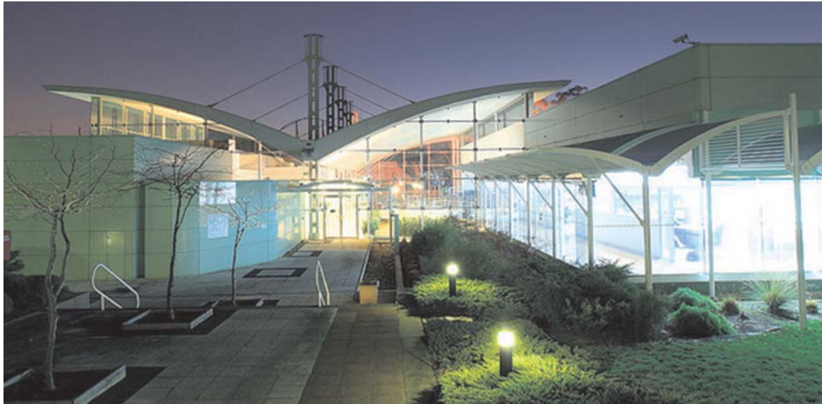
Micro-analytical facility, Bundoora, Melbourne